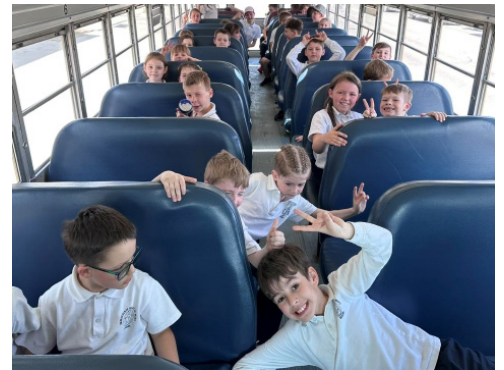
Newcomers heading to a special field trip – bowling!