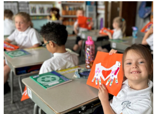
Grade one student making Mother's Day cards.